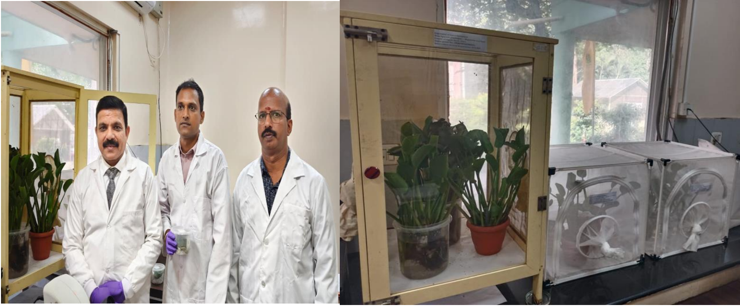
Release of insects by Director in the quarantine facility of ICAR-NBAIR, Bengaluru