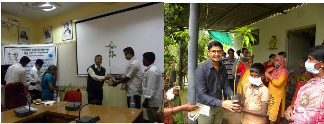
Tree saplings supplied to the farmers