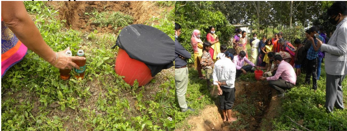
Vermi culture demonstrated to the farmers