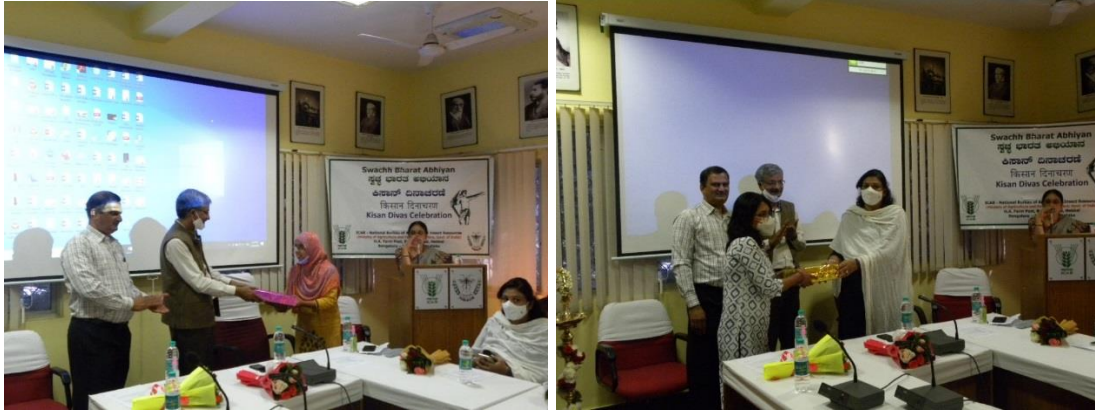
Prizes distributed to the winners of Elocution and Essay competition related with Swachh Bharath