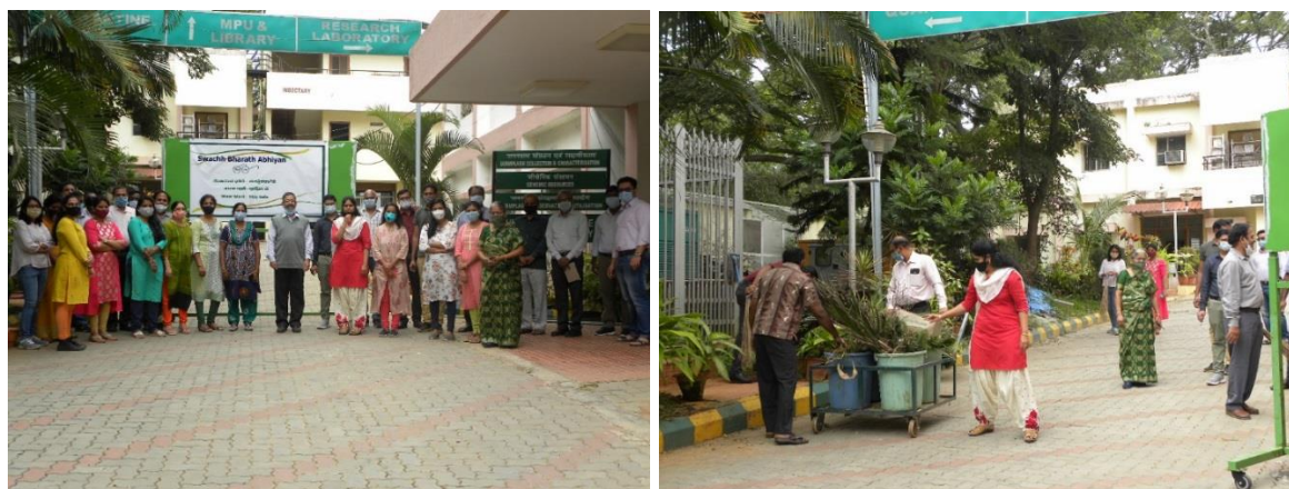
Cleaning activity carried out at ICAR-NBAIR, Hebbal campus