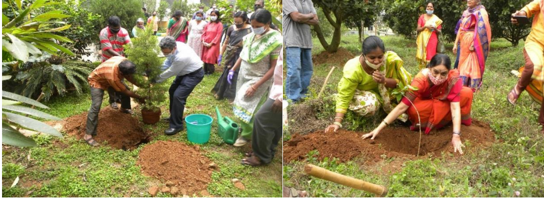
Tree planting carried out in the villages and at office-premises