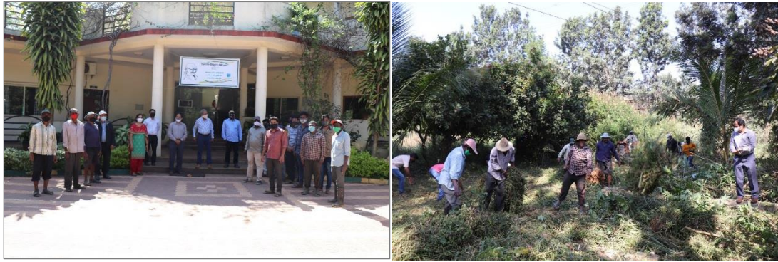
Cleaning activity carried out near-by water pond area at ICAR-NBAIR, Yelahanka campus