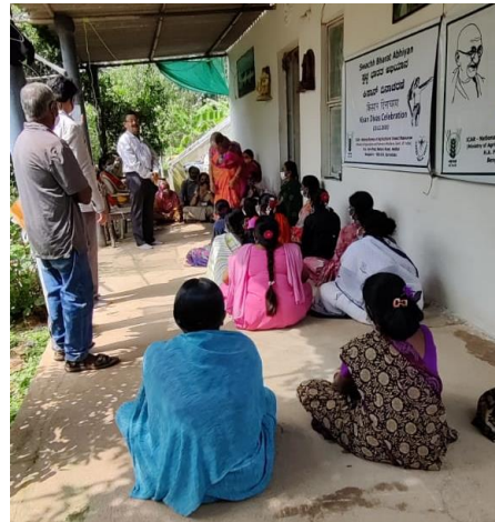
Awareness given to the farmers regarding the guidelines of Covid-19 and Cleanliness