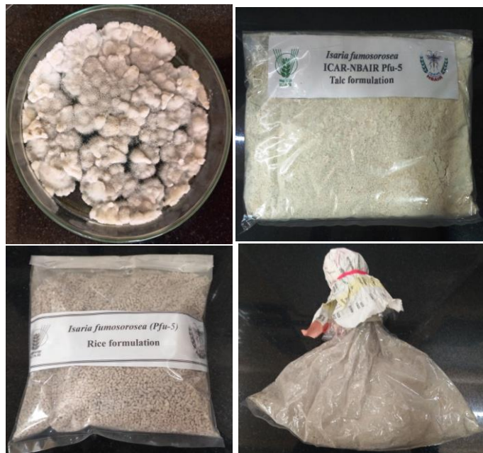
Fig. 3: Talc and rice based formulations of Isaria fumosorosea

ICAR-NBAIR is carrying out extensive research on biological control of this pest on a priority basis under its core programme as well as under a project funded by the Coconut Development Board, Kochi. ICAR-NBAIR has developed biocontrol strategies using parasitoids and the entomofungal pathogen I. fumosorosea for the efficient management of the RSW within a short span of time. Economic analysis of the impact of conservation and augmentation of E. guadeloupae and foliar application of I. fumosorosea for management of RSW indicated that about Rs 9500/ha crop protection cost and 900 ml of pesticides/ha are being saved.