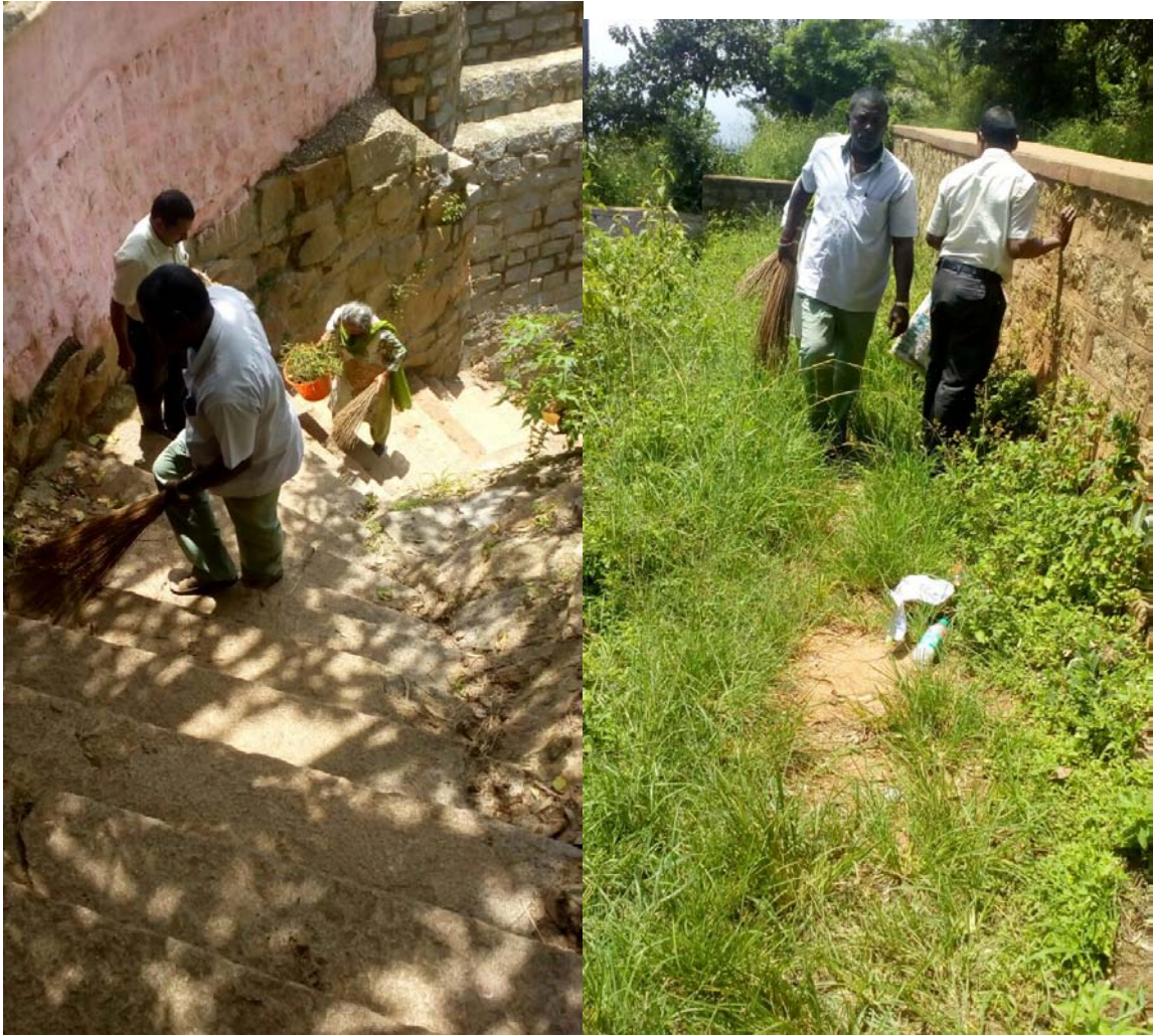
Plastic waste collection and weeding undertaken