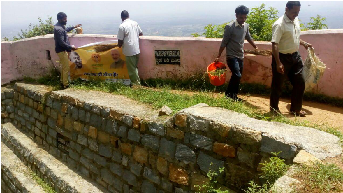
ICAR-NBAIR Hebbal Staff cleaning premises of NANDI HILLS during the celebration of Sarvatra Swachhta Divas

Sarwatra Swachhta Divas was celebrated at ICAR-NBAIR Hebbal campus. Nandi hills which is a famous tourist spot was cleaned in some areas (Source of River Palar) and made free from plastic covers, plastic bottles, etc. Also weeding was done in few areas. The pond was also cleaned and made free from plastic. The public awareness was done by displaying Swachhta banner and educating people on cleanliness.