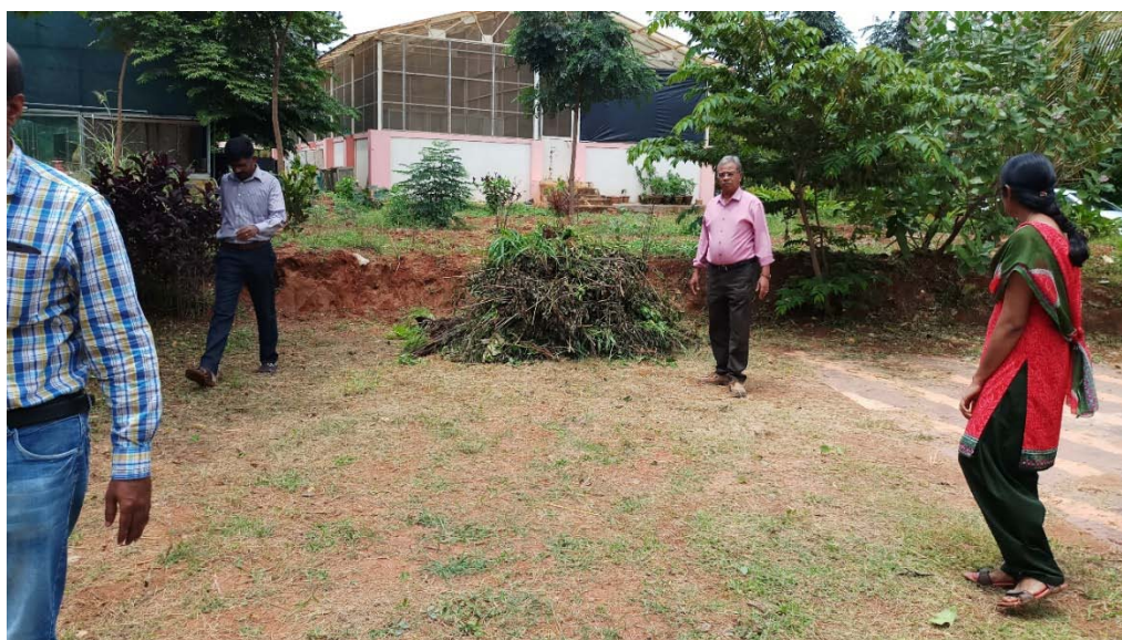
ICAR-NBAIR Yelahanka Staff involved in cleaning of Parthenium during celebration of Sarvatra Swachhta