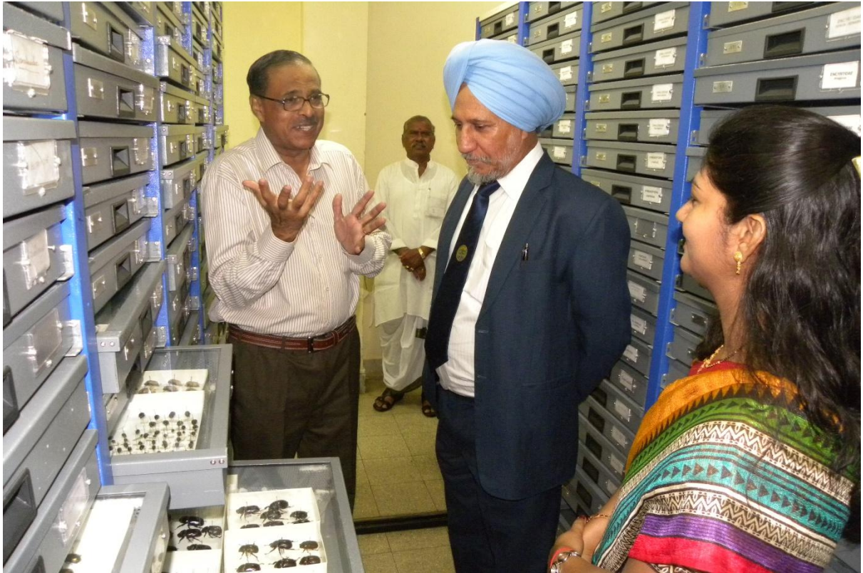
Insect museum was main attraction