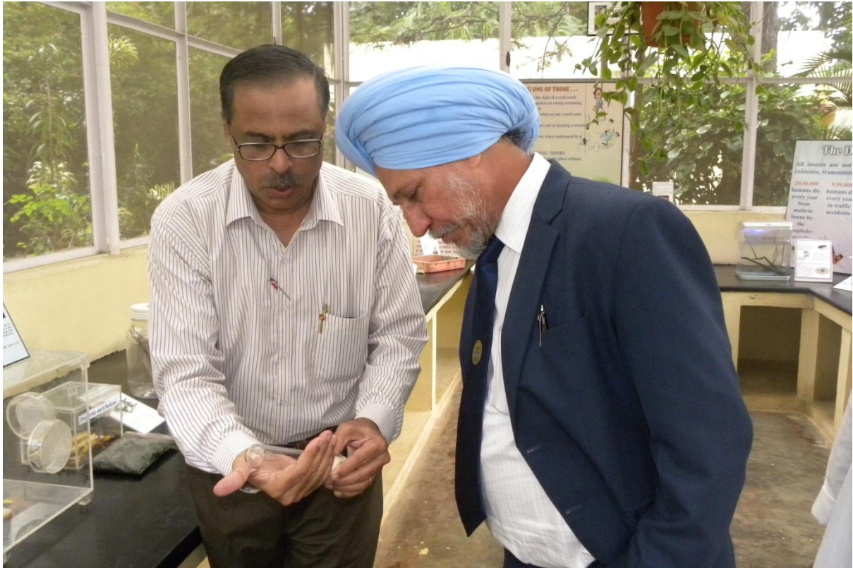
DDG (CS) observing the insectarium collection of ICAR-NBAIR, Director, NBAIR (Left) explains the collections.