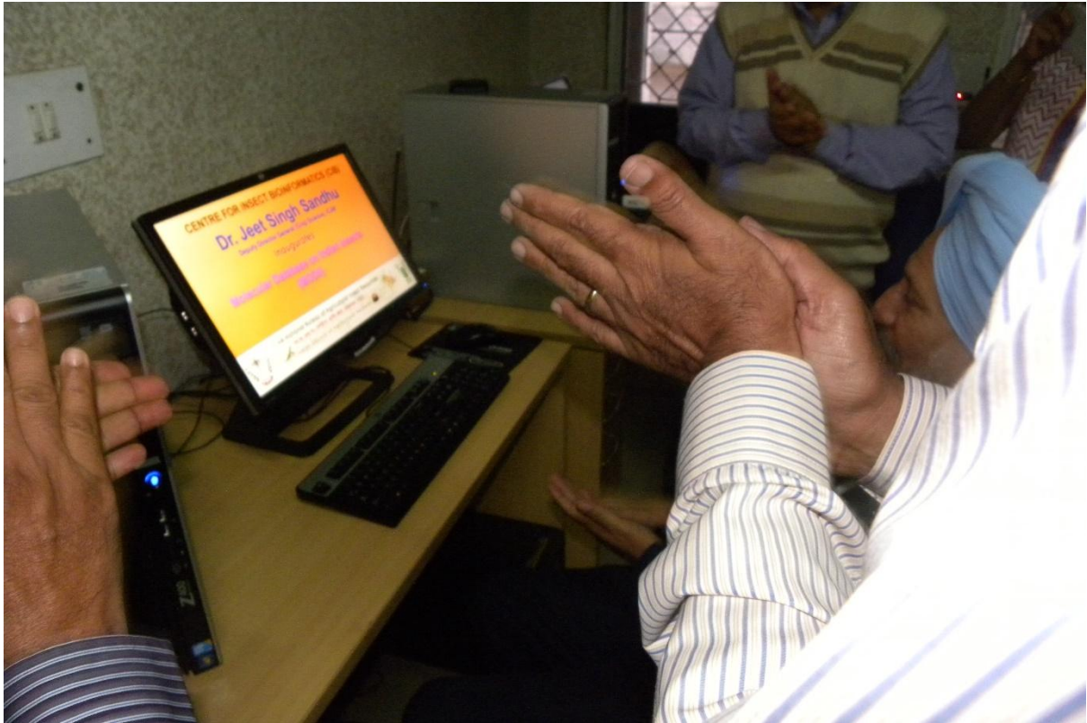
DDG (CS) launches the MODII database